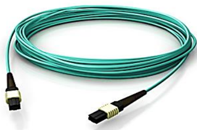
(Only for reference)